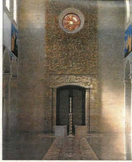
The west wall depicts the Transfiguration of Christ, with glass sculpture by Gabriele Wilpers of Essen, Germany; stained glass oculus window by Helen MacLean; and stone sculpture by Régis Demange.